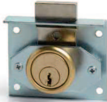
CERRADURA PARA ARMARIO CABINET LOCKS